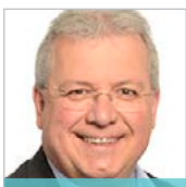
Markus Ferber Member, European Parliament