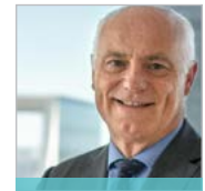
José Manuel Campa Chairperson, European Banking Authority